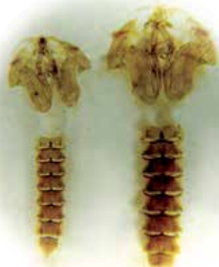
Chironomid exuviae specimens (magnified) from the collection