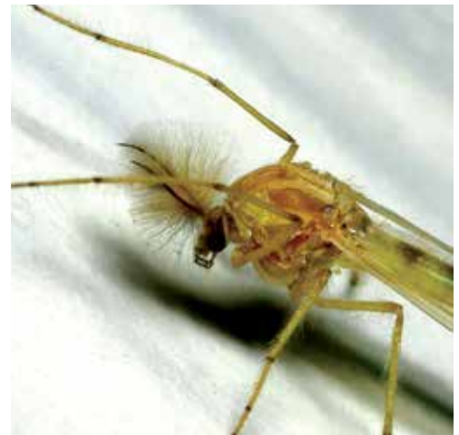
A male midge in the wild

It turns out that midges are so ecologically diverse, the absence or presence of certain species in an ecosystem signals what's happening in the environment. Some midges live only in pristine water, while others can thrive in foul water, laced with contaminants or sewage. Some midges like heat, others cold. Coffman's collection technique enables biologists to collect extensive samples of midges, even over time at the same locale, to gauge what's happening: Which type of midge exists in a particular ecosystem? Have